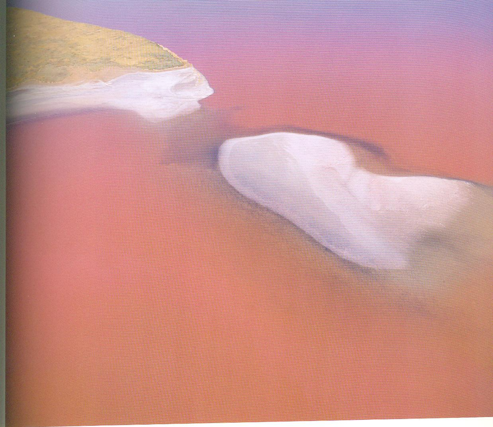
Rozheve (Pink) Lake, Tavria 46°3'7.28"N 34°44'3.7"E Serhiy Sverdelov