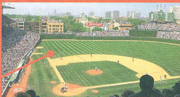
5 Wrigley Field Baseball Stadium