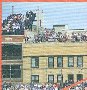
4 Stands on a roof near Wrigley Field Stadium