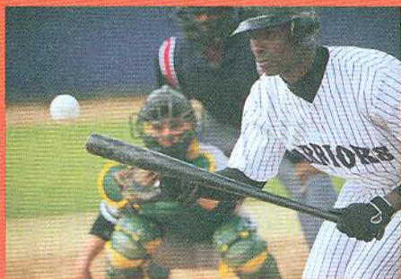
2 Baseball: The batter wants to score a run.