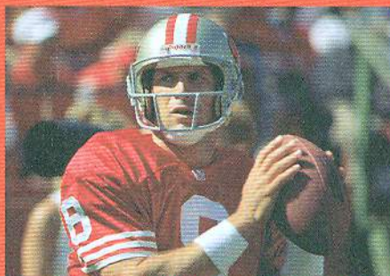
3 American football player in action